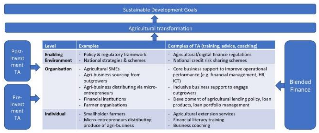
Table 4. Types of TA recipients and examples of TA

Discussions of TA in the context of (blended) finance typically focus on advisory, assistance and training provided to investee businesses or financial institutions directly, but not necessarily other ecosystem actors. Here, we take TA to more fully encompass the existing range of services and service recipients: TA for (blended) finance encompasses 'advisory, assistance or training to the investee business or other value chain and ecosystem actors provided either pre- or post-investment to reduce transaction costs and operational risks and increase developmental impact'.<sup>8</sup>