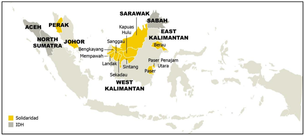
NI-SCOPS jurisdictions in Indonesia and Malaysia