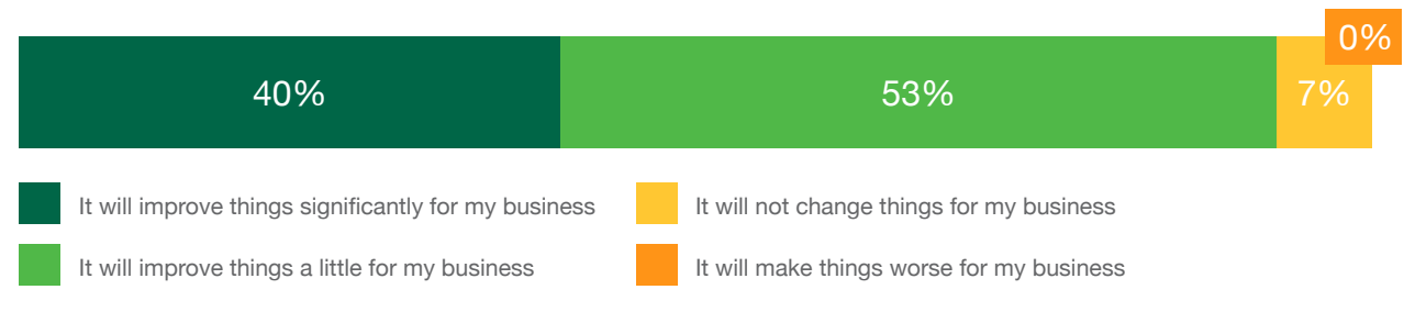
Figure 2: Perceived impact of AfCFTA on the business performance for IDH Farmfit clients

A vast majority of companies surveyed by IDH Farmfit expressed a desire to increase their participation in regional food trade, however strengthening production markets and supply chains are a more immediate priority to resolve.